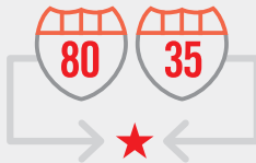
Crossroads of I-80 / I-35 and part of USMCA corridor.

Des Moines International Airport has 1.2 million square feet in cargo apron.