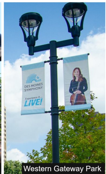
Western Gateway Park