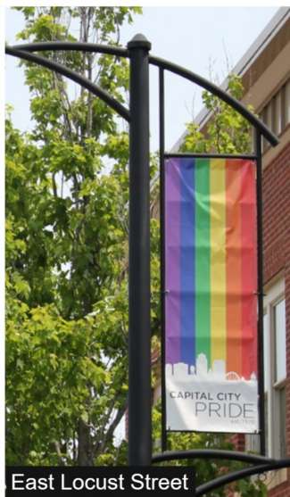
East Locust Street