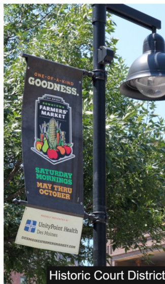
Historic Court District